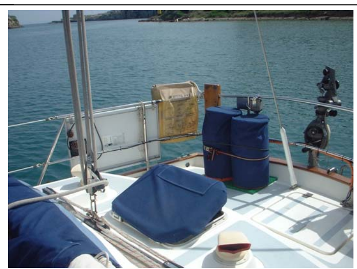
Note Hydrovane Wind Steering